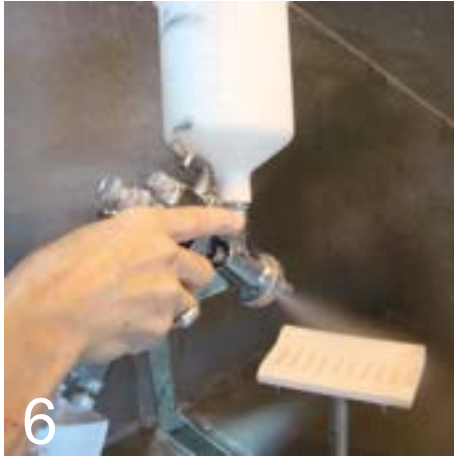
6. APPLICATION OF THE ENAMEL